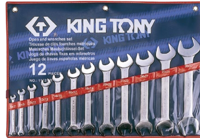
• MR / SR : Nylon pouch bag