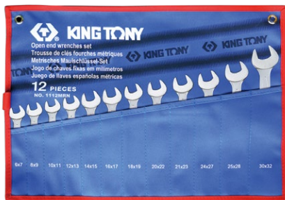
• MRN / SRN : Teton pouch bag