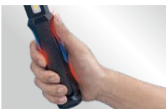
• Ergonomic Handle