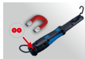
• Strong bottom magnet with two functional hooks