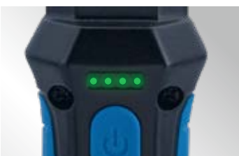
• Battery indicator