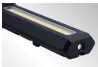
• Top light