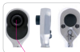
magnet 2765-04G (top, side, back)